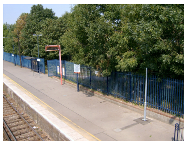
The poles have arrived! The real-time info system will be installed on the new pole and the old clock removed (Queenborough)

I welcome more interest and participation from across Sheppey as the rail line serves us ALL, not just those living close to the stations. It serves the mainland too and that is why our next presentation is at Kemsley. So come on board and join in the fun.