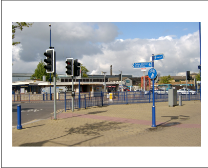
The utterly unimposing approach to Sheerness station from the town and seafront

Short term projects will be started this autumn with longer-term issues stretching into next year. The aim is to make the station a vibrant part of the town it serves with an on-going programme of an ever-changing vista.