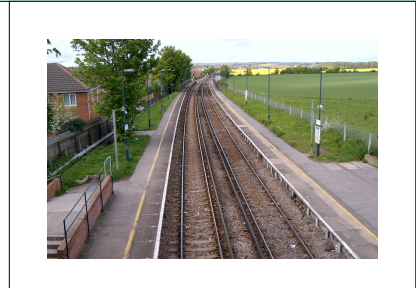
We are working towards resolving security issues at Kemsley, starting with CCTV, preparatory to commencing station improvements that will include real-time information for passengers.