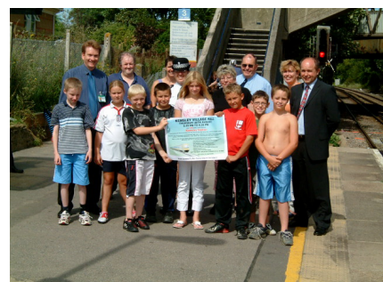
Youngsters from the Swale Youth House (SHA) launching the Kemsley event

issues we've been tackling. The newspaper, the Sheerness Times Guardian, has been particularly supportive on Sheppey and has run many stories. And, of course, this is our third newsletter. In between times we have given many talks to clubs, societies, parish councils and school pupils. Our presentations are absolutely FREE. We've called on all sectors of the community including businesses (a number have provided project sponsorship), schools and even HMP Stanford Hill.